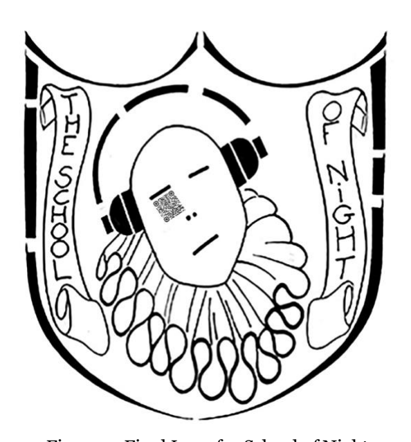
Figure 3: Final Logo for School of Night