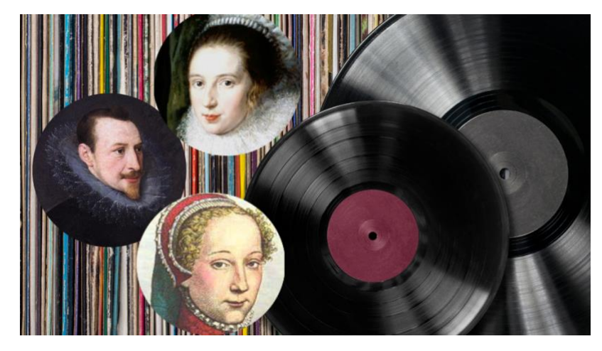
Figure 6: Image created by Jeffrey Day (UC Davis)