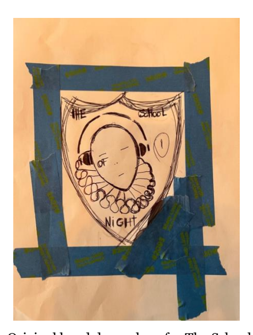
Figure 2: Original hand drawn logo for The School of Night

I knew I wanted to have an Elizabethan ruff, and at first I did a sketch by hand, and then after that, I drew it on my tablet, sketching it there so that I could change the size. I made the ruff bigger. I wanted the helmet (headphones) very simple, as well as the eyes, everything, it's all simple lines. I put a little QR under the eyes too so you can scan and go straight to listen to the tracks.